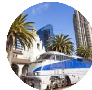
CLOSE PROXIMITY TO FREEWAY AND COASTER