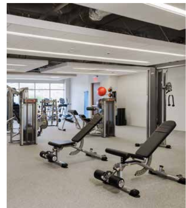
MODERN SOPHISTICATED DESIGN