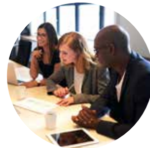
INDOOR/OUTDOOR COLLABORATIVE GATHERING AREAS