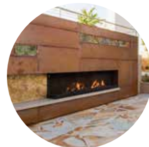
OUTDOOR FIRE PIT