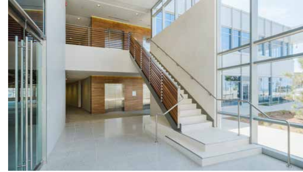
AMENITY-RICH 21 ST CENTURY WORKPLACE