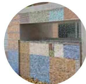
OUTDOOR WATER FEATURE